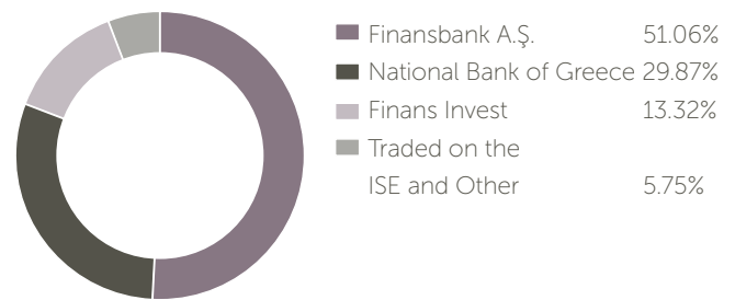
Shareholding Structure as of 31 December 2011

Finans Leasing will further cultivate long-term partnerships and innovative industry expertise, and will continue to offer a wide range of value-added solutions to its clientele and all other stakeholders.